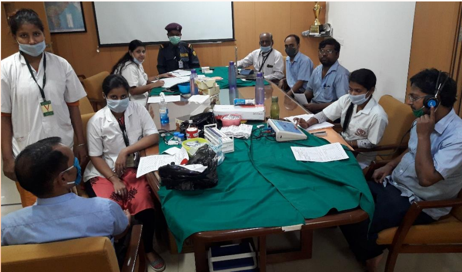
The annual Health check-up for employees at Industrial Packaging, Navi Mumbai was organised on 1 st February 2021.