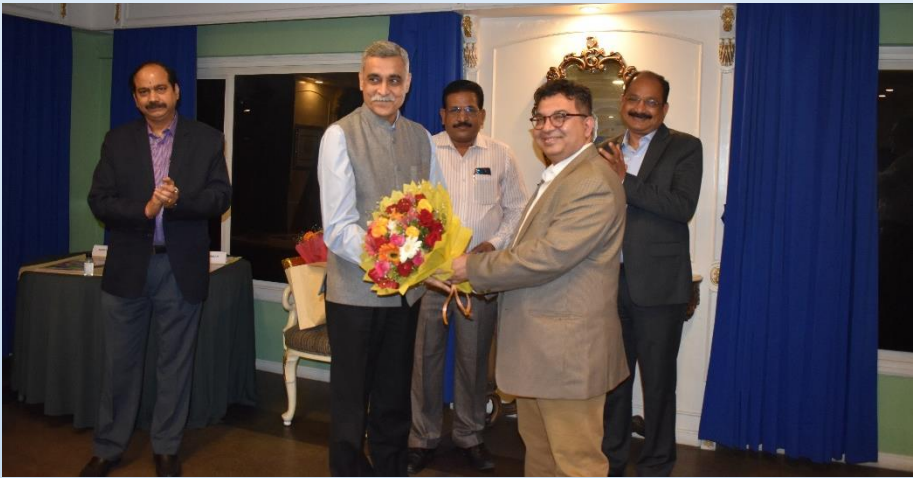
A farewell function was organised by the Top Management Team at Kolkata