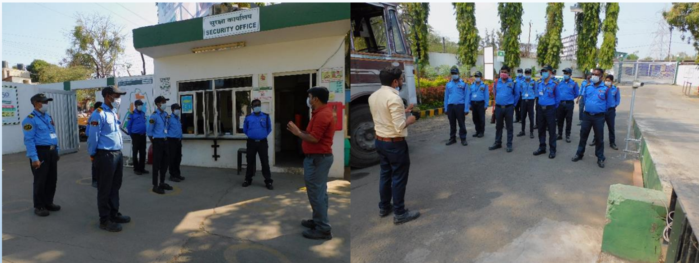
A training program for Security Personnel at Greases & Lubricants, Silvassa was organised in the month of February 2021.