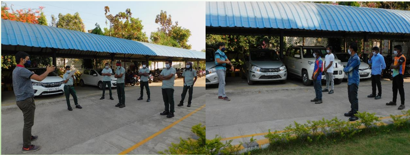
In Greases & Lubricants, Silvassa training sessions on prevention on COVID-19 are conducted on every Monday of the month. In photo are sessions being conducted in February 2021.