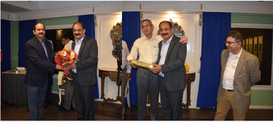
A farewell function was organised by the Top Management Team at Kolkata