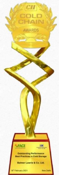
Balmer Lawrie & Co. Ltd