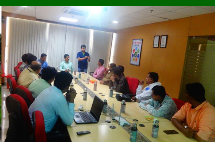
On 12 th October 2019 distributors and mechanics associated with brand Balmerol in the region visited the Greases & Lubricants plant at Silvassa.