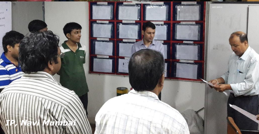
IP, Navi Mumbai