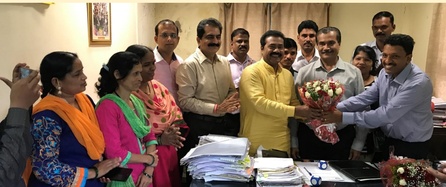
The Long Term Settlement of LI, Mumbai was signed on 6 th July 2017 at the Labour Commissioner's Office in Mumbai.