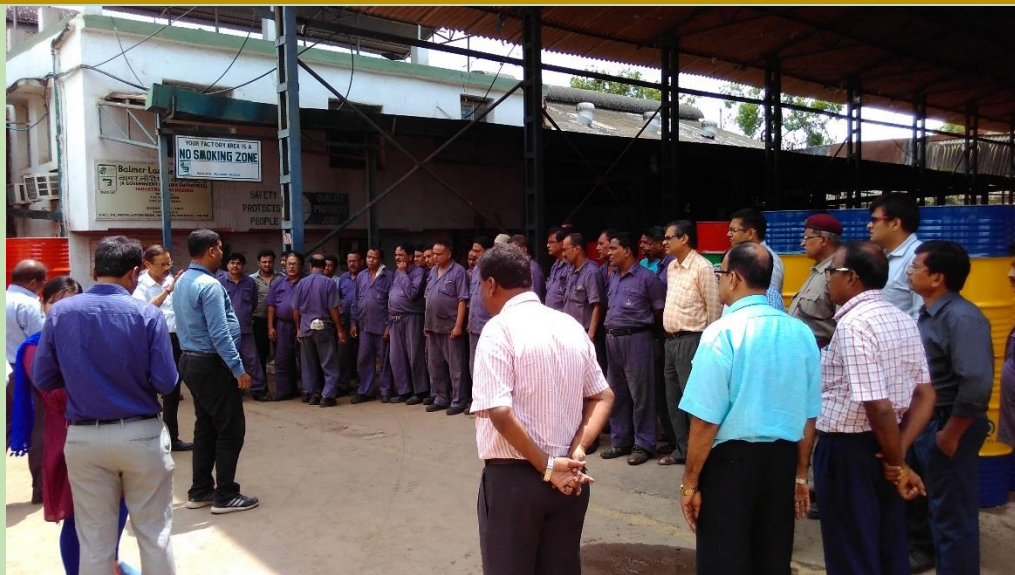
Mock Drill at IP, Kolkata