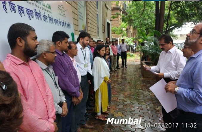
Mumbai 18-07-2017 11:32