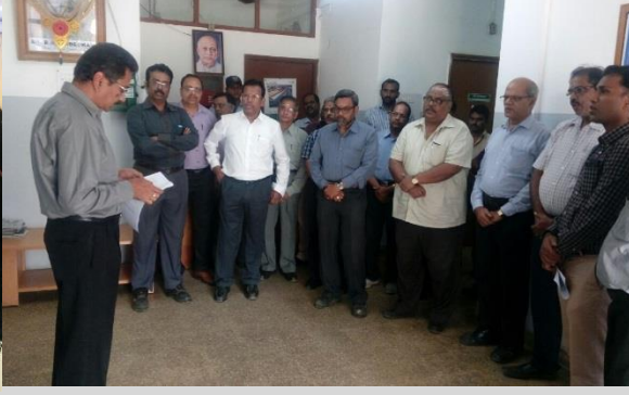
26 th November was celebrated as Constitution Day or Samvidhan Divas. On this day in the year 1949, the Constituent Assembly of India adopted the Constitution of India, and it came into force on 26 th January 1950. Constitution Day is celebrated in honour of Dr. B R Ambedkar, who was the architect of the Indian Constitution. In photo are glimpses of the pledge being administered in Delhi, Mumbai and Chennai.