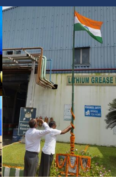
Greases & Lubricants Plant, Kolkata