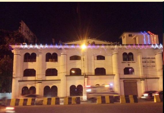
BL Office in Teynampet, Chennai