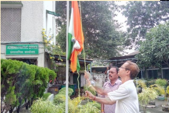
Industrial Packaging Plant, Kolkata