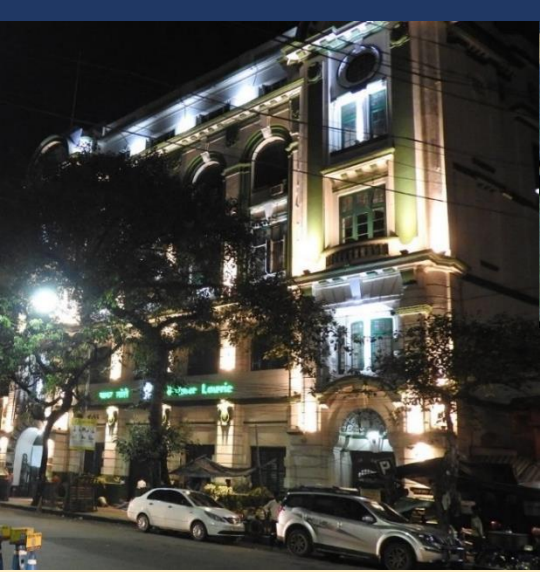
Corporate Office, Kolkata