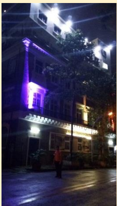
BL Office in Ballard Estate, Mumbai