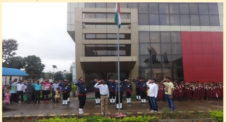
Greases & Lubricants Plant in Silvassa

Independence Day was celebrated with much fervour in units and establishments across locations. The tricolour was hoisted, buildings were adorned with LED lighting and in some places cultural programs were also held.